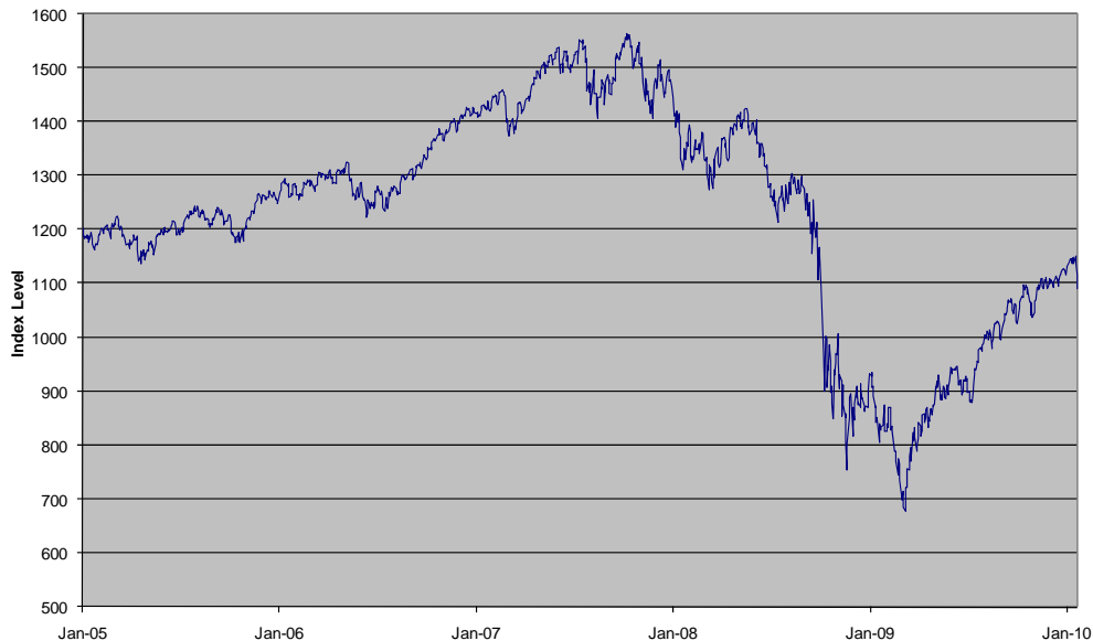
Historical Performance of the S&P 500 ® Index